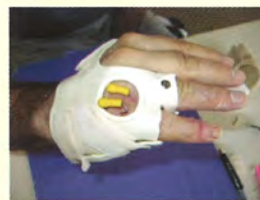
Custom Splinting and Delta Casting