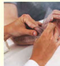
Range of Motion / Evaluation